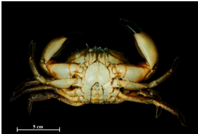
Fig. 1. Eriphia verrucosa in Akliman shores of Sinop Peninsula of the Black Sea

E. verrucosa is a type of crab which is locally called “küflü” and consumed extensively by people in spring and summer. All the warty crab samples were captured in 2017. This crab usually lives in shallow water under rocks and between seagrasses. E. verrucosa , which is a characteristic form for the hard substratum of the upper-infralittoral at depths of 1–8 m, has an average length of (10 \pm 1.5) cm (Fig. 1).