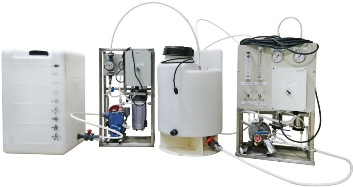
Fig. 3. View of portable installation modules for concentrating water samples

The pre-cleaning module is equipped with a cold water meter with a measurement error of no more than 2 %. It ensures control of source volume of water supplied for concentration.