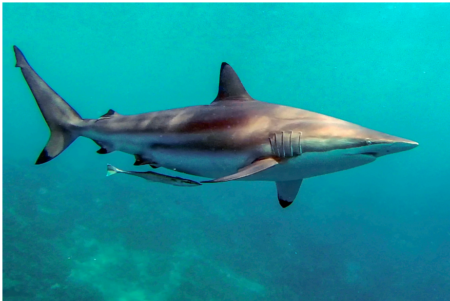
Fig. 2. Spinner shark Carcharhinus brevipinna accompanied by live sharksuckers Echeneis naucrates , observed in the waters in front of Kooddoo's harbour, in Villingili pass, Northern Huvadho Atoll, Southern Maldives.

The species identification was based mainly on the morphological descriptions given in Castro (1983), Compagno (1984), and De Maddalena et al. (2015).