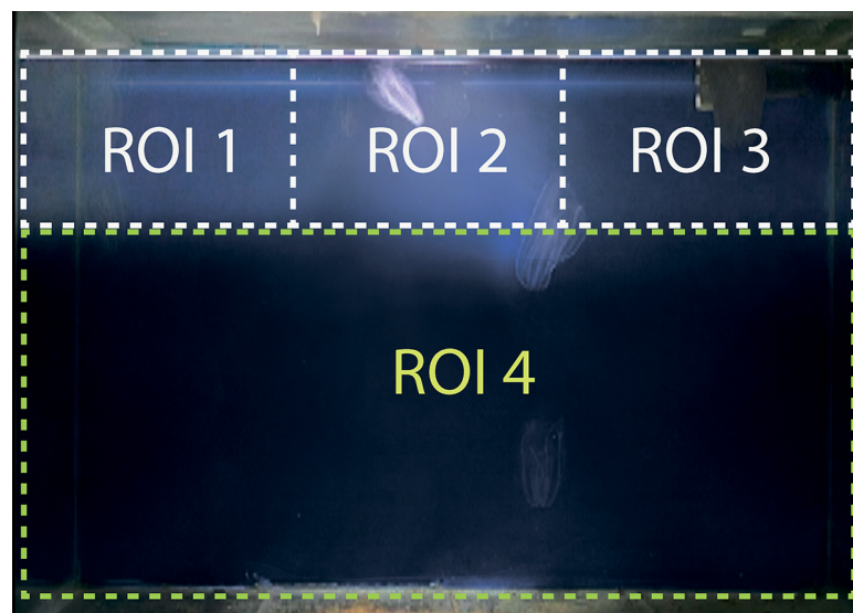
Fig. 2. Regions of interest (ROI): 1, a region with high level of illumination; 2, with medium level of illumination; 3, with low level of illumination; 4, a dark region

The movements of ctenophores were recorded in time-lapse mode (1 frame in 2 seconds; 300 frames in 10 minutes) using a camera mounted perpendicular to a front wall of the aquarium. We used a Nikon D5300 camera with a Nikon AF-S Micro-Nikkor 40mm lens and a Hoya 52mm PL polarizing filter. After turning on the light, the experiment was carried out during the time intervals as follows: 1–10, 31–40, and 51–60 minutes.