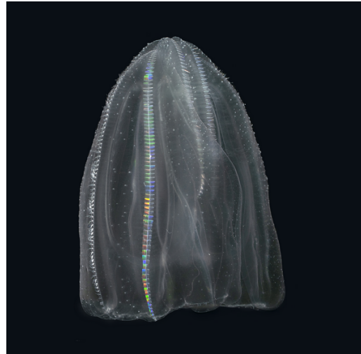
Fig. 1. An adult Black Sea ctenophore Mnemiopsis leidyi