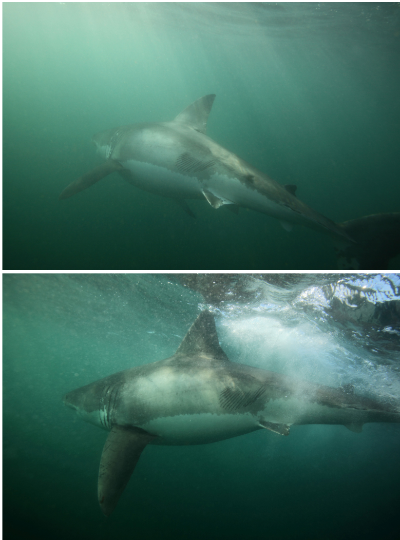
Fig. 1. Estimated 3.5-m female great white shark Carcharodon carcharias bearing tooth rake marks by an orca Orcinus orca on the left side of its trunk, observed on 7 July, 2017, at Seal Island in False Bay, Western Cape, South Africa.

Photos of the sharks were taken with two cameras for subsequent analysis (Fig. 1).