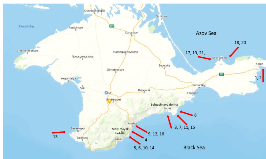
Fig. 1. Sampling sites for the isolation of luminescent bacteria

Sampling. To isolate bacteria in the northern coastal zone of the Black Sea and Sea of Azov, seawater and various hydrobionts were sampled May to October 2016–2018 (Fig. 1). The samples were placed in sterile containers and transported to a laboratory for further processing, which was carried out no later than 24 h after sampling. Details of the sampling location and their characteristics are provided in Table 1.